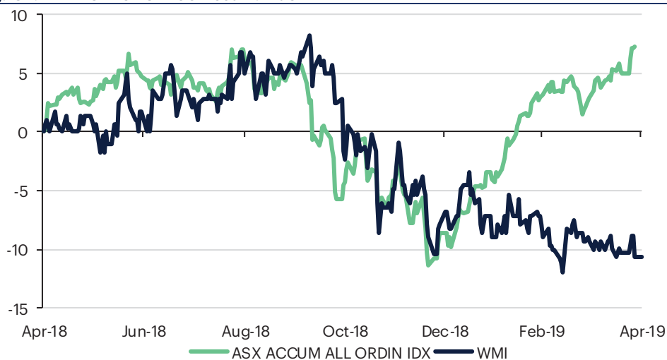
Fig.134: WMI TSR vs ASX200 Accum. Index

Figures as at 31 March 2019. Active returns refers to the TSR and NTA growth relative to that of the comparative index (see chart below).