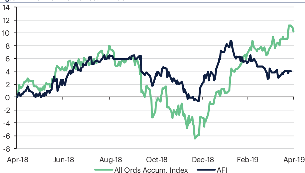
Fig.6: AFI TSR vs All Ords Accum. Index

Source: IRESS, Bloomberg, Baillieu, Company reports. Figures as at 31 March 2019. Active returns refers to the TSR and NTA growth relative to that of the comparative index (see chart below).