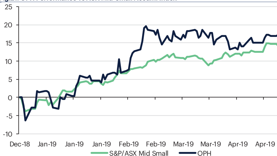
Fig.21: OPH Performance vs ASX Mid-Small Accum. Index

Figures as at 30 April 2019 (unless otherwise stated). Active returns refers to the TSR and NTA growth relative to that of the comparative index (see chart below).