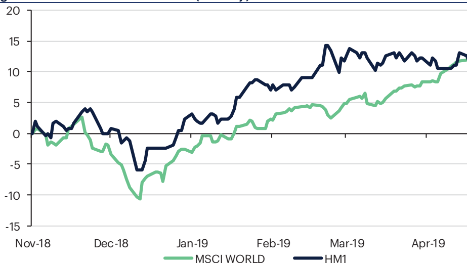
Fig.58: HM1 TSR vs MSCI World Index (AUD adj.)

Figures since inception (14-Nov-18). Active returns refers to the TSR and NTA growth relative to that of the comparative index (see chart below).