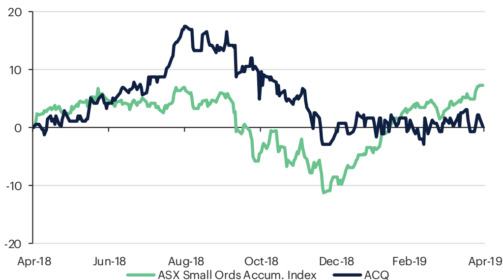
Fig.13: ACQ TSR vs ASX Small Ordinaries Accumulation Index

Figures as at 30 April 2019. Active return refers to TSR and NTA growth relative to that of the comparative index (see chart below).