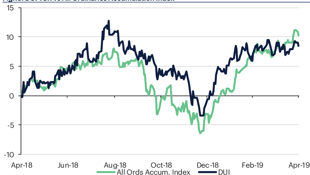
Fig.15: DUI TSR vs All Ordinaries Accumulation Index

Figures as at 30 April 2019. Active return refers to TSR and NTA growth relative to that of the comparative index (see chart below).