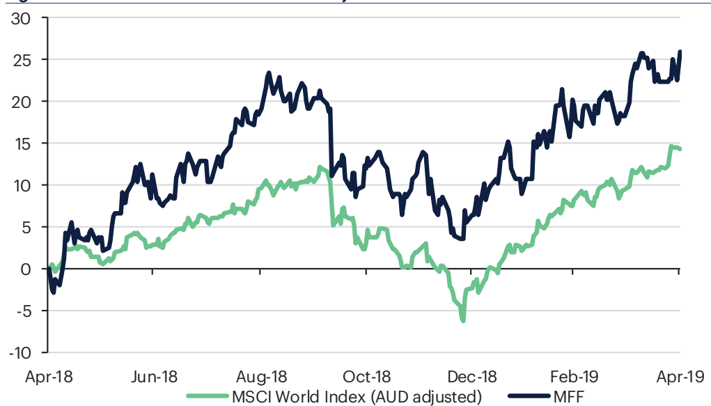
Fig.19: MFF TSR vs MSCI World Index AUD adjusted

Source: IRESS, Bloomberg, Baillieu, Company reports. Figures as at 30 April 2019. Active return refers to TSR and NTA growth relative to that of the comparative index (see chart below).